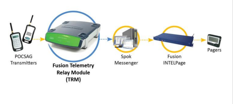
FIGURE 3 – PAGING MESSAGE CONFIRMATION